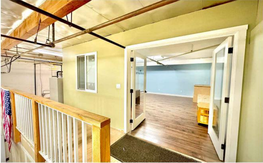
STETSON EARHART, INC. 260 Sheridan Avenue, Suite 130, Palo Alto, CA 94036