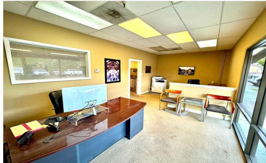
STETSON EARHART, INC. 260 Sheridan Avenue, Suite 130, Palo Alto, CA 94036

ALL RIGHTS RESERVED. THE INFORMATION CONTAINED IN THIS COMMUNICATION IS STRICTLY CONFIDENTIAL. THIS INFORMATION HAS BEEN OBTAINED FROM SOURCES BELIEVED TO BE RELIABLE BUT HAS NOT BEEN VERIFIED. NO WARRANTY OR REPRESENTATION, STETSON EARHART 260 Sheridan Avenue, Suite 130, Palo Alto, CA 94036 CHANGE OF PRICE, RENTAL OR OTHER CONDITIONS, WITHDRAWAL WITHOUT NOTICE, AND TO ANY SPECIAL LISTING CONDITIONS IMPOSED BY THE PROPERTY OWNER(S). ANY PROJECTIONS, OPINIONS OR ESTIMATES ARE SUBJECT TO UNCERTAINTY AND DO NOT EXPRESS OR IMPLIED, IS MADE AS TO THE CONDITION OF THE PROPERTY (OR PROPERTIES) REFERENCED HEREIN OR AS TO THE ACCURACY OR COMPLETENESS OF THE INFORMATION CONTAINED HEREIN, AND SAME IS SUBMITTED SUBJECT TO ERRORS, OMISSIONS, SIGNIFY CURRENT OR FUTURE PROPERTY PERFORMANCE.