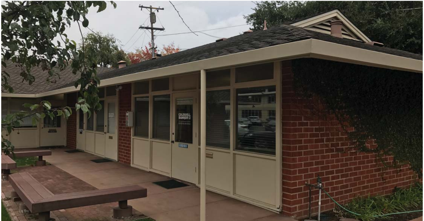
DOWNTOWN MENLO PARK OFFICE